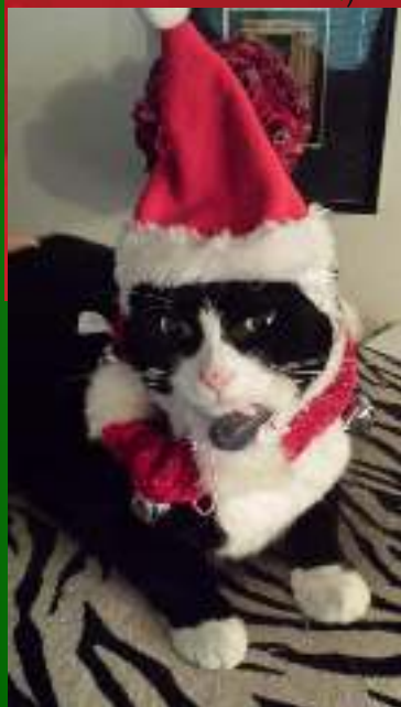
Sergei, the happy Christmas Cat is all dressed up for action

personal enjoyment spectacular performances great arrangements